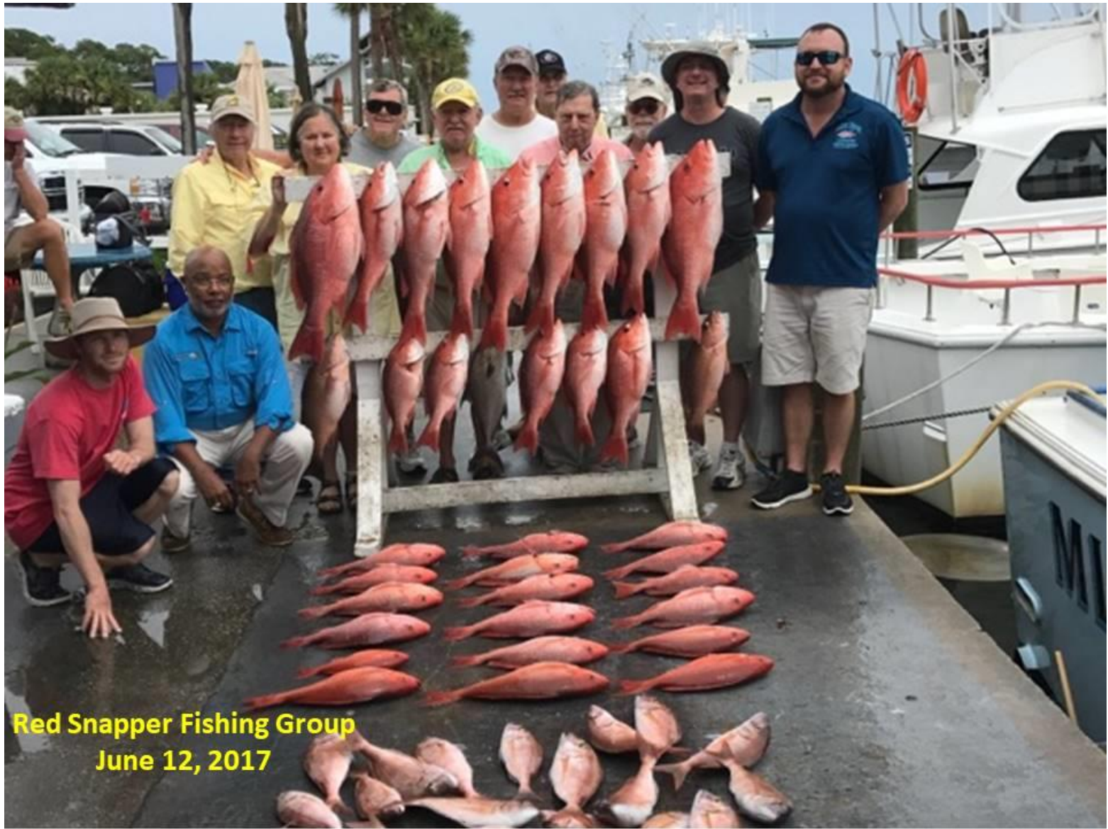
Red Snapper Fishing Group June 12, 2017